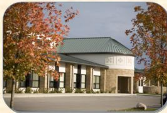
Women's Treatment Center