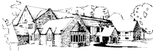
Rochester Treatment Center 1969 - Present