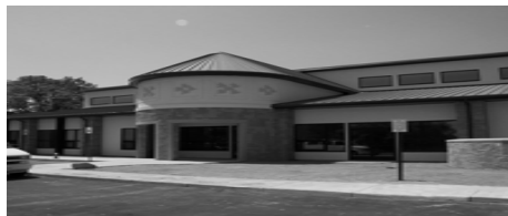
Guest House for Women Religious 2007 - Present