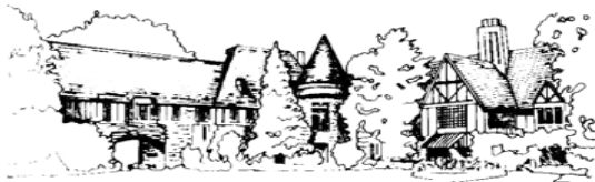
Guest House Treatment Center 1956 - 2007